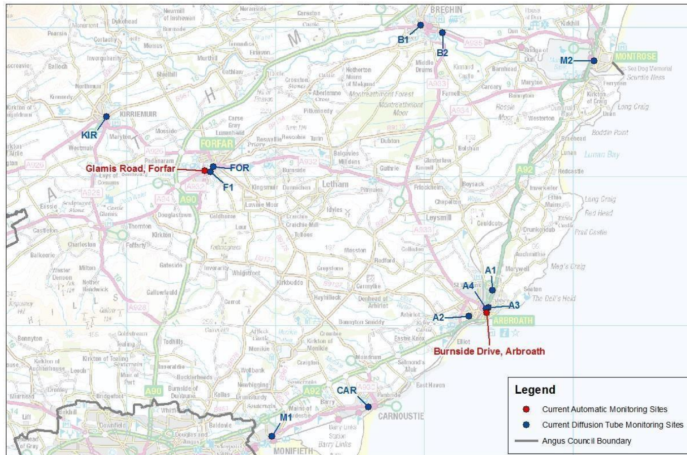
Figure D.3. Current air quality monitoring sites in Angus